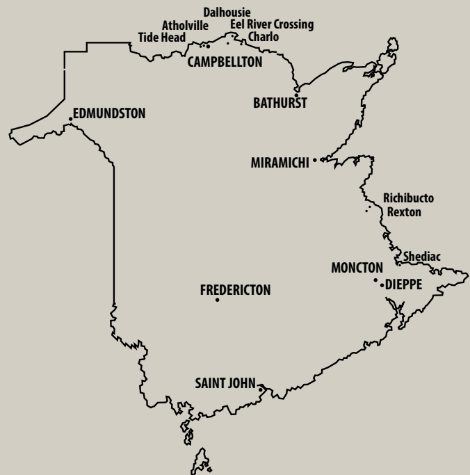
Cities and other municipalities with language obligations